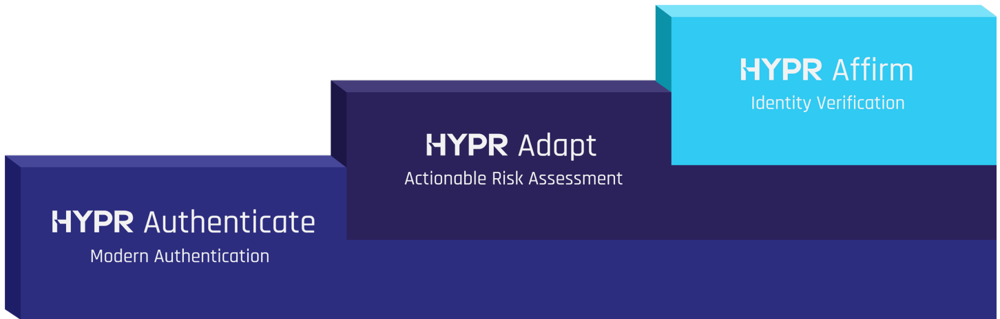
The HYPR Identity Assurance Platform

Identity verification is an automated and ongoing process that begins with first contact and is integrated into identity management and help desk workflows. HYPR Affirm leverages AI-powered chat, video, facial recognition and other cutting-edge technologies to create a seamless and secure method of confirming employee and customer identities – and re-verifying them at critical moments in time – without ever using a password.